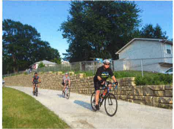
South O bike trail

The connection has been in the works for a decade.