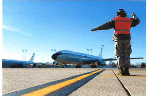
Offutt runway showcase

"I am pleased that our military leaders, after thorough analysis, are committing the necessary resources to protect Offutt as an important part of our national security infrastructure," Fortenberry said in a press release.