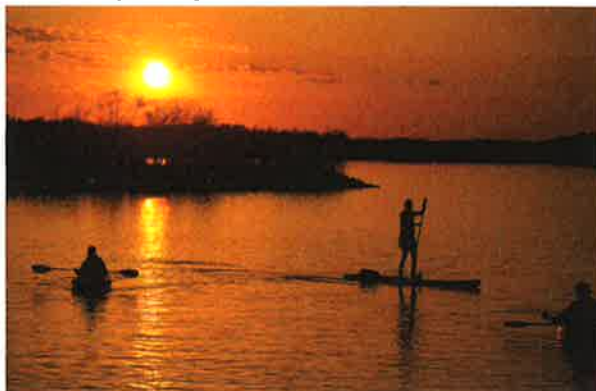
Zorinsky Lake sunset